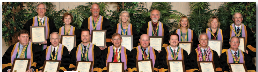
Congratulations to the new 2009 International College of Dentists Fellows!